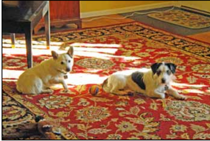
Chipper, left, and Tweed, right

Meet Good Dogs, Chipper and Tweed. Chipper is 17 years old (1), Tweed is 2. Both reside with Beverly Plack on NW 153 rd Place. According to Beverly, both dogs are very proud to be July's Good Dogs.