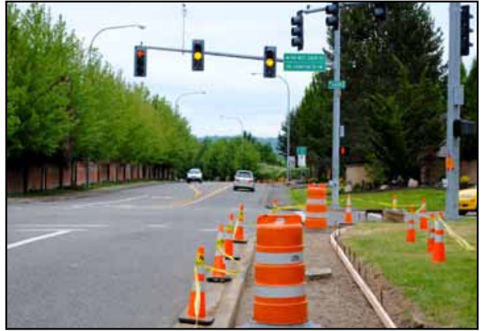
Prep work for sidewalk being constructed on 143rd Avenue's east side. Photo looks north at intersection with West Union Road.

The project is part of Washington County's Minor Betterment Program.